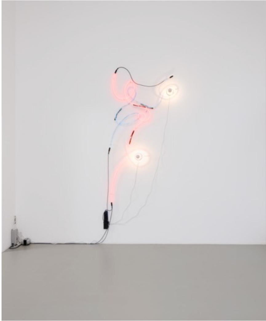
Vue de l'exposition, Files, Shields and Neons , Galerie Mitterrand, Paris, 2020 / Exhibition view, Files, Shields and Neons , Galerie Mitterrand, Paris, 2020.