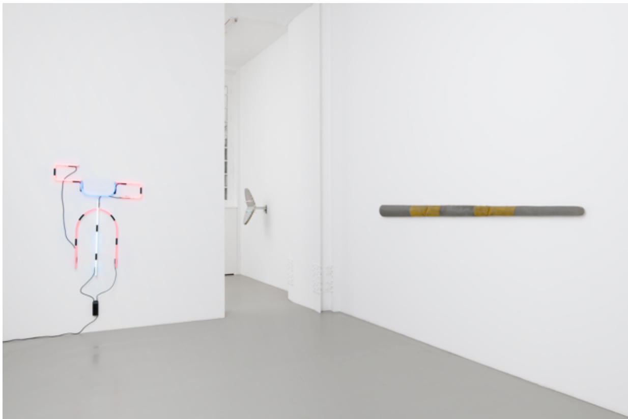
Vue de l'exposition, Files, Shields and Neons , Galerie Mitterrand, Paris, 2020 / Exhibition view, Files, Shields and Neons , Galerie Mitterrand, Paris, 2020.

79 RUE DU TEMPLE 75003 PARIS - T +33 1 43 26 12 05 F +33 1 46 33 44 83 INFO@GALERIEMITTERRAND.COM WWW.GALERIEMITTERRAND.COM