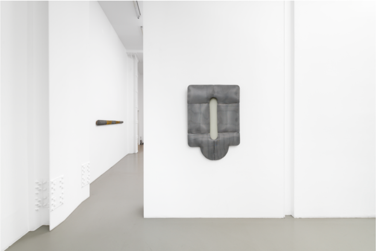
Vue de l'exposition, Files, Shields and Neons , Galerie Mitterrand, Paris, 2020 / Exhibition view, Files, Shields and Neons , Galerie Mitterrand, Paris, 2020.

79 RUE DU TEMPLE 75003 PARIS - T +33 1 43 26 12 05 F +33 1 46 33 44 83 INFO@GALERIEMITTERRAND.COM WWW.GALERIEMITTERRAND.COM