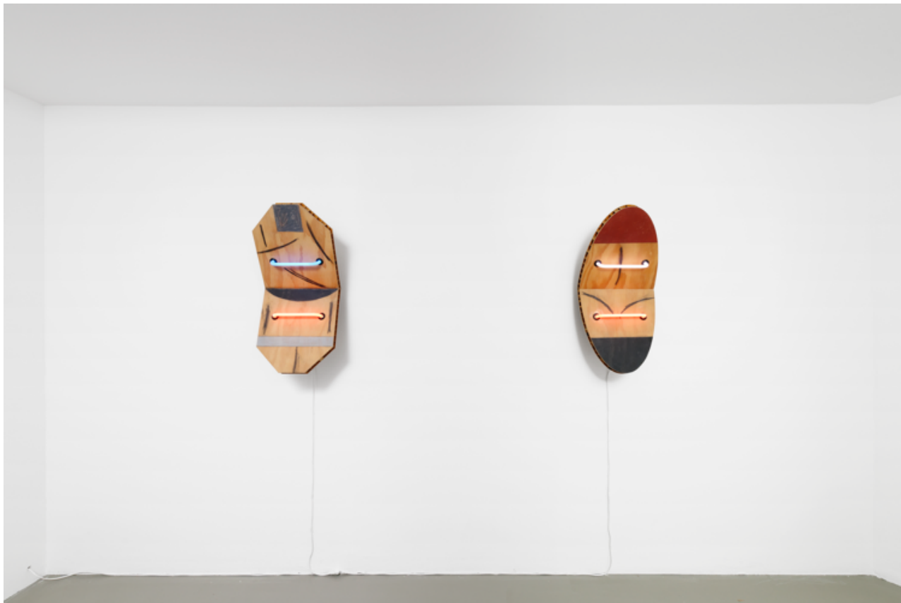
Vue de l'exposition, Files, Shields and Neons , Galerie Mitterrand, Paris, 2020 / Exhibition view, Files, Shields and Neons , Galerie Mitterrand, Paris, 2020.